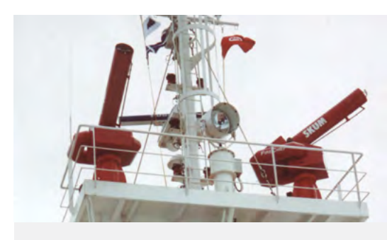
Specialist Foam Extinguishing System