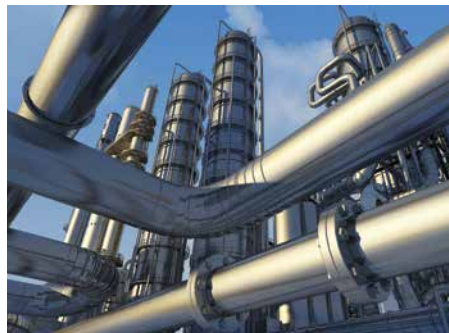
Petro/Chemical Manufacturing Plants