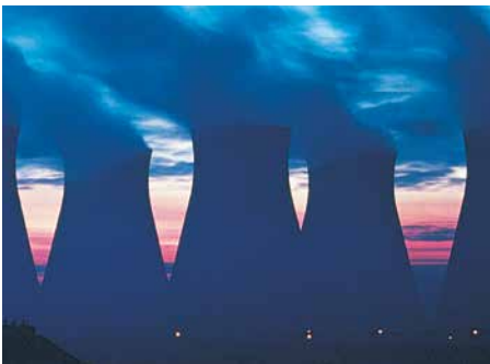
Power Generation Plants

Our BlueStream hybrid cooling system combines air-cooled and water-cooled heat rejection systems with advanced controls, reducing water usage by up to 80% while optimizing efficient energy use. Excellent for either new or retrofit applications.