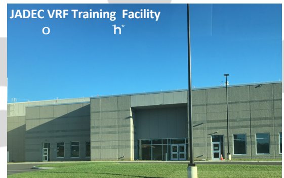
JADEC VRF Training Facility