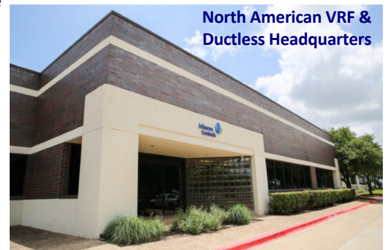
North American VRF & Ductless Headquarters